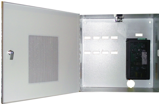
TP LARGE CABINET

PO Box 90 Kurrajong NSW 2758 Australia Tel +61 1300822769 sales@tacpower.com.au